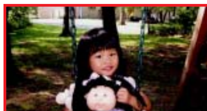
Enjoying the day