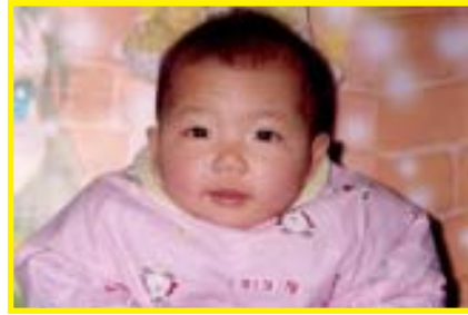
Foster Care Photo