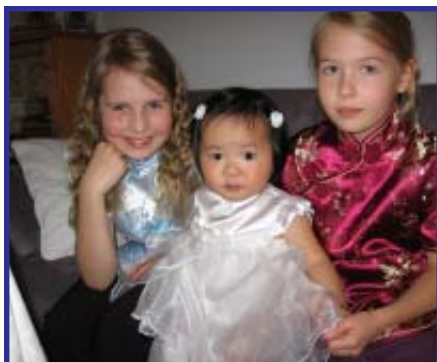
Three Lovely Sisters