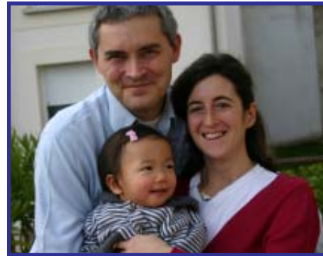
A Happy Family

In each issue of the Hunan Foster Care Program newsletter I would like to share stories and pictures of children who have been adopted and were in our program. If you have adopted a child who was fostered in our program, please feel free to send me stories about your adoption experience or about how your child is doing now that they are home. I will try to feature 2-3 stories and pictures in each newsletter. The From Home to Hunan section is really a sharing place for families!